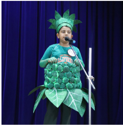
Fancy dress and Peom competition 7 April,2025