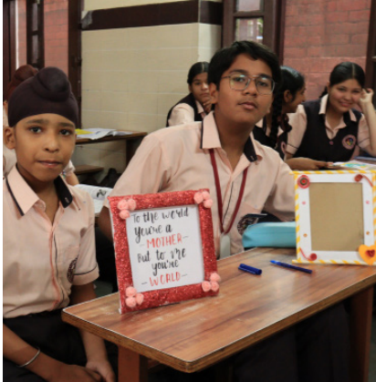
Card making activity on Mother's day 2 May,2025