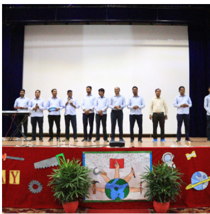
School Day and Labour's Day 30 April,2025