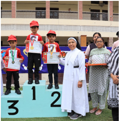
Kindergarden Sports Day 2 May,2025