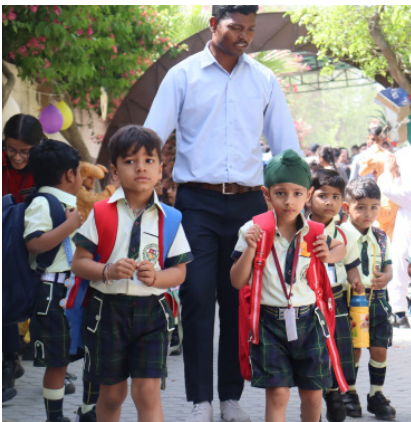
Nursery Welcome 1 April,2025