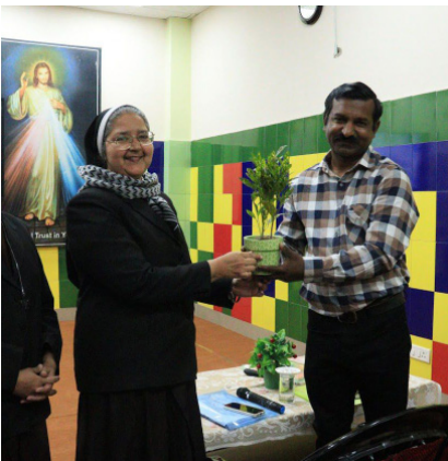
Orentiation Programme for Teachers 15 march,2025