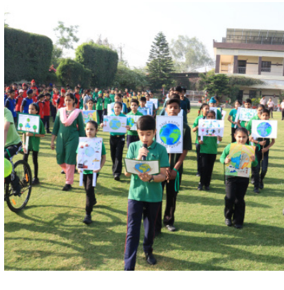
World Earth Day Competition 7 April,2025