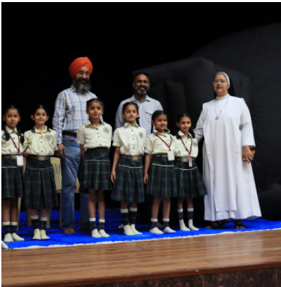
E-Plantarim 5 May,2025