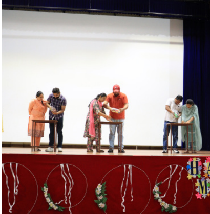
Mother's Day Celebration 3 May,2025