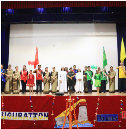
Literary and Cultural Inauguration 1 April,2025