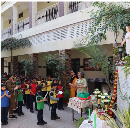
Novena Prayer 21-30 April,2025