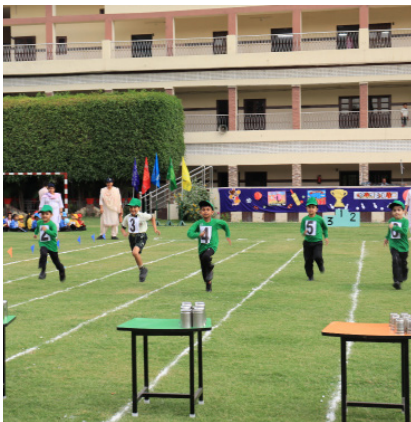
Kindergarden Sports Day 2 May,2025